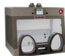
New BacBasic anaerobic work station from Sheldon Mfg.