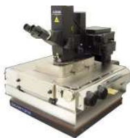
Signatone Probe stations and 4 point probe stand