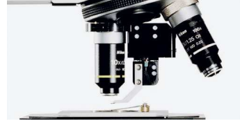
WITec- Confocal Raman, NSOM, AFM

WITec will be in Booth 1173 with their Confocal RAMAN, AFM, NSOM.