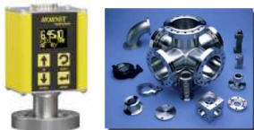
Vacuum chambers, components and leak detectors. Catalogues are available