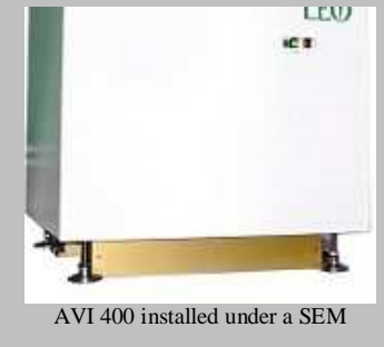
AVI 400 installed under a SEM

We still have Kinetic Systems air flotation work stations and optical tables.