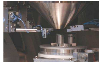
Tescan SEM w/ Manipulator

Samples are typically difficult to run at a show like this, but we may be able to handle a few. Let me know if you want to bring something for a look and we'll try. . .